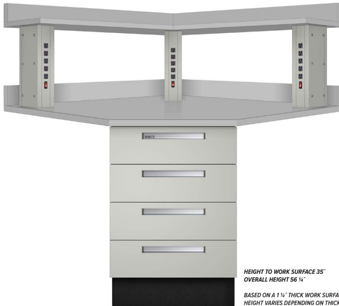
HEIGHT TO WORK SURFACE 35" OVERALL HEIGHT 56 1/4" BASED ON A 1 1/4" THICK WORK SURFACE. HEIGHT VARIES DEPENDING ON THICKNESS.

Teclab workbenches share common design features that have earned for Teclab the reputation in the industry as the “professional’s bench.” Typical features include an abundance of grounded outlets within easy reach; an infinite variety of drawer and door combinations to meet every job and storage requirement; expansive work surfaces, shelves, and back guards in a choice of task-oriented materials.