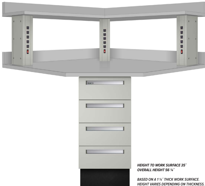
HEIGHT TO WORK SURFACE 35" OVERALL HEIGHT 56 1/4" BASED ON A 1 1/4" THICK WORK SURFACE. HEIGHT VARIES DEPENDING ON THICKNESS.

Teclab workbenches share common design features that have earned for Teclab the reputation in the industry as the “professional’s bench.” Typical features include an abundance of grounded outlets within easy reach; an infinite variety of drawer and door combinations to meet every job and storage requirement; expansive work surfaces, shelves, and back guards in a choice of task-oriented materials.