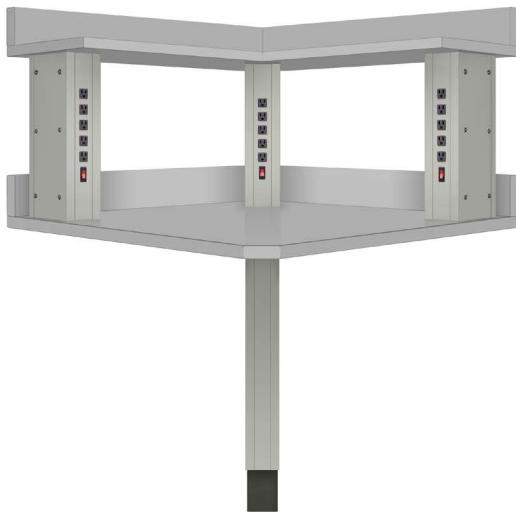
HEIGHT TO WORK SURFACE 35" OVERALL HEIGHT 56 1/4" BASED ON A 1 1/4" THICK WORK SURFACE. HEIGHT VARIES DEPENDING ON THICKNESS.

Teclab workbenches share common design features that have earned for Teclab the reputation in the industry as the “professional’s bench.” Typical features include an abundance of grounded outlets within easy reach; an infinite variety of drawer and door combinations to meet every job and storage requirement; expansive work surfaces, shelves, and back guards in a choice of task-oriented materials.