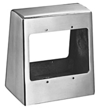
EP-1313 Double Sided Double Pedestal

Please call for electrical requirements not shown here.