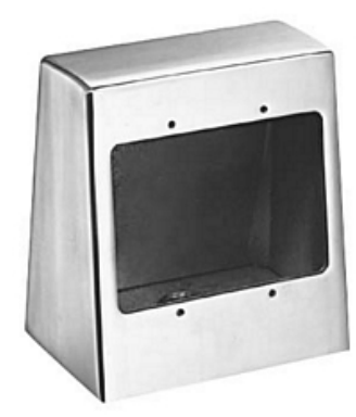
EP-1312 Single Sided Double Pedestal

Please call for electrical requirements not shown here.