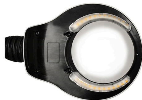
Head: Bottom View